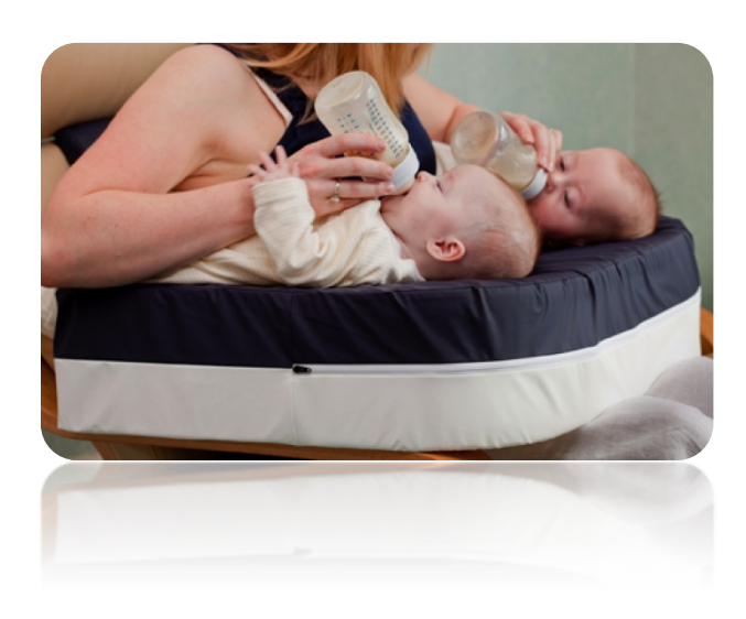
Special Pillows for Nursing Twins are available