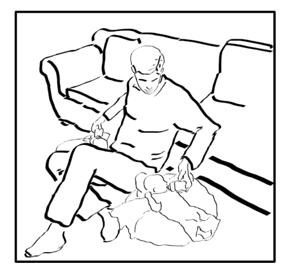
Or...Create your own!

Having and nursing twins can be a wonderful, fulfilling experience. Mothers are encouraged to relax and enjoy this special time in their lives. We are here to support you!